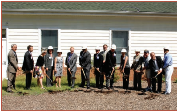
Approximately 75 individuals attended the groundbreaking of a 4,000 s.f. addition to NVFS' SERVE campus shelter building.

A groundbreaking was held on August 2 for a 4,000 square foot addition to Northern Virginia Family Service's (NVFS) SERVE campus shelter building. The project will increase shelter capacity from 60 to 92 beds, allowing NVFS to reach an additional 250 individuals a year. HomeAid Northern Virginia, Builder Captain K. Hovnanian Homes and approximately 20 trade partners are teaming up on the estimated $1.2 million project, of which an estimated 60 percent will be covered by donations and discounts from trade partners and other stakeholders, including the Freddie Mac Foundation, Prince William County, the City of Manassas, and EE Wine. Approximately 75 individuals attended the groundbreaking, including representatives from HomeAid, K. Hovnanian, NVFS, other community non-profits, private and public companies, and elected officials. The addition is projected to be completed by the end of this year.