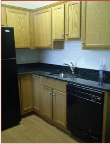
The new kitchen features new appliances, cabinets and countertops.

When Reston Interfaith bought its 47th townhome to help serve another low-income family, they bought it knowing it would need significant renovations. HomeAid Northern Virginia and Winchester Homes jumped in to help, and along with 12 trade partners, together transformed key areas of the three-bedroom, two-bath home. The total retail value of the project came in at approximately $30,000.