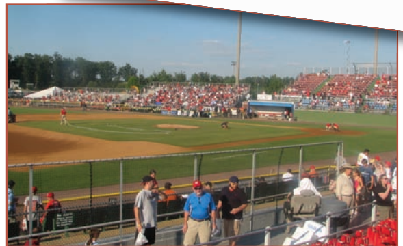
Dozens of families from area shelters enjoyed a night at Pfitzner Stadium for a Potomac Nationals game, thanks to HomeAid Northern Virginia.